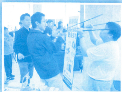
工友們正協助中心職員準備攤位

此外，為推廣中心的業務及讓更多的社區人士認識本中心，中心聯同工友參加了由社會福利署舉辦的推廣