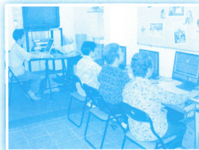
The elder paid full concentration in using the training programs.

Starting from 10 March 2004, the training course on the 'Application of Multimedia Training Program for the Elderly' was organized for two elderly service centres namely, the PHAB Stanley Neighbourhood Elderly Centre and Yan Chai Hospital Tang Pik Wan Memorial Neighbourhood Elderly Centre. The training course consists of 12 sessions. The training programs developed by our Association are used as a training media in addition to other group activities. The training can enhance the participants' responsiveness and eye hand co-ordination abilities. The feedback from the participants was very encouraging. They commented that the course was very interesting and stimulating. Their response and eye hand co-ordination ability have also proved to have improved. In view of the positive response, the training course will be further promoted. Any agencies / centres interested in organization of this training course can contact our Association for further details.