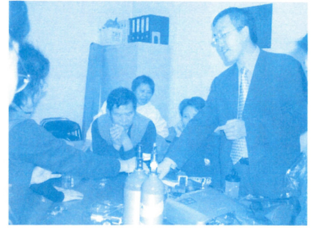
The speaker explained the application of oxygen concentrator.

S taff of Medicare Health Products Co. Ltd. was invited to deliver a talk on "Long Term Oxygen Therapy" to workers of the Integrated Home Care Service on 3 February 2004. During the talk, operation of oxygen concentrator was demonstrated. With the acquisition of knowledge on the application of the machine, more effective service can be rendered to our service users who are using the machine.